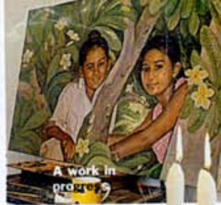
A work in progress

Your favourite cartoon character? Bambi ☐