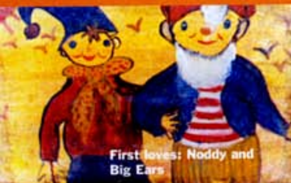
First loves: Noddy and Big Ears