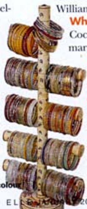
Circles of colour

How has Buddhism influenced you? I value Buddhism as it is about love, living and being loved. About living life, striving for a balance and harmony, forgiving, staying positive and being